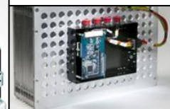
Compressible Phase-Change or Pressure Sensitive Thermal Interface Materials