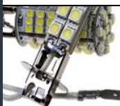
Sub-Mount Melt-Bonding or Pressure Sensitive Thermal Adhesives