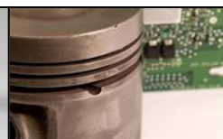
Insulated Metal Thermal Substrate for Camber-Free Power Electronics