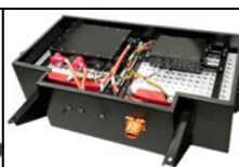
Electro-thermal Die, Component, and Substrate Adhesives