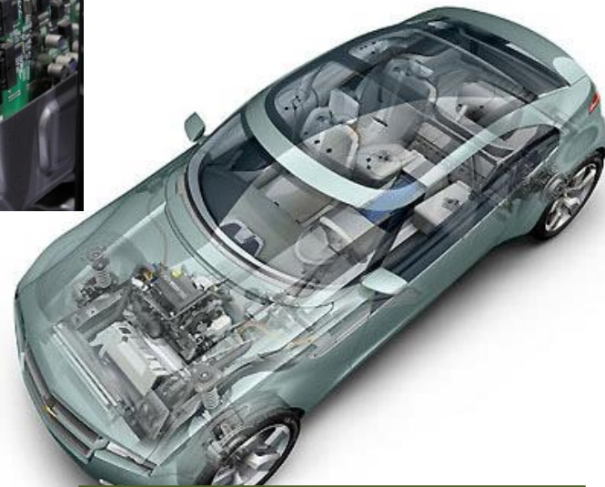
THERMAL CONDUCTIVE DIE-ATTACH